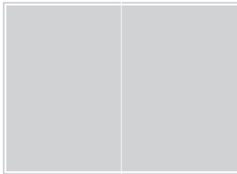
2-Page Spread 9.57" w x 7.875" h (Premium positions only)